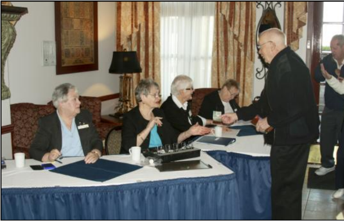
Volunteers greet members and register their attendance.