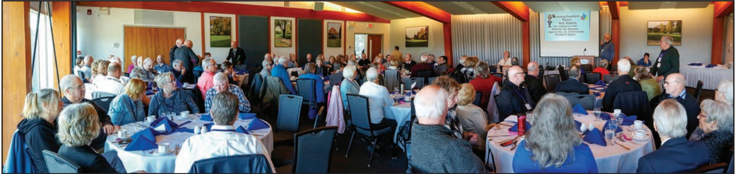
March 28, 2019 - Annual General Meeting held at the Nanaimo Golf Club- 125 attendees