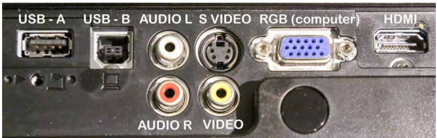
Input ports on the Epson projector

We have the capability to connect a variety of video and audio cables.